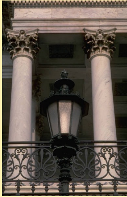
WELCOME BACK TO ALL NEW AND RETURNING STUDENTS AND FAMILIES!

As of Wednesday, August 22nd, the classrooms and hallways of Broadwater School were filled once again. This year marks the 103rd year that our school has been a haven for teach-