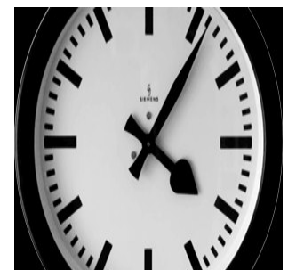
Please make sure kids are not arriving to school before 7:55, unless they are part of the Breakfast Program.

gram. Students who show up early will be expected to sit in the gym with their classmates until there is teacher supervision on the playground. Thank you for helping to make our school a safe place for all students and staff members!