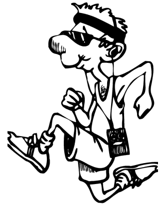
Way to go Broadwater Panthers You all rocked it at the County Cross Country Meet!

Best Overall Time: Briana Haskins - 6:18