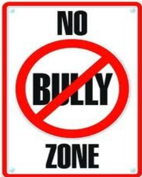
Broadwater School strives to be a Bully-Free School.

“Our goal is to eliminate any/all bullying type behaviors at Broadwater School...”